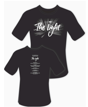
EXAMPLE: 2019 Show Shirt

T-SHIRTS: Every band member will receive one show t-shirt included with their 2026 marching band fee. This form is for ADDITIONAL shirts for students or parents. Each shirt is $20. Parents - This shirt is custom to the show for that particular year. It will include the show logo and the band logo. This is a great way to show your Westfield Band spirit throughout our fall season!